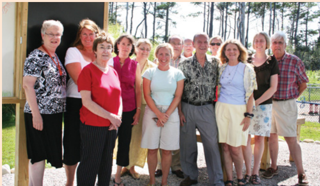
Dare Education Foundation Board of Directors visit the new outdoor classroom at Nags Head Elementary School.