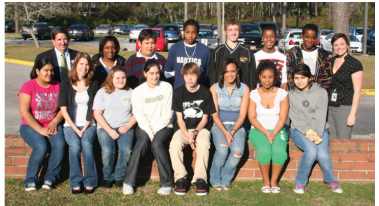
Pictured above as sophomores, the first AVID class will graduate from Manteo High School in June, 2011.

DEF's dream, shared with our partners, is about to come true. With over $200,000 invested by DEF, the first AVID (Advancement Via Individual Determination) class that began at Manteo Middle School in 2005 will graduate from Manteo High School in May 2011. Nearly 200 students are now enrolled in AVID district-wide and the results for these students will be nothing less than amazing. (Read more about AVID on page 3.)